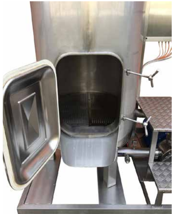
Large hatch to facilitate easy extraction