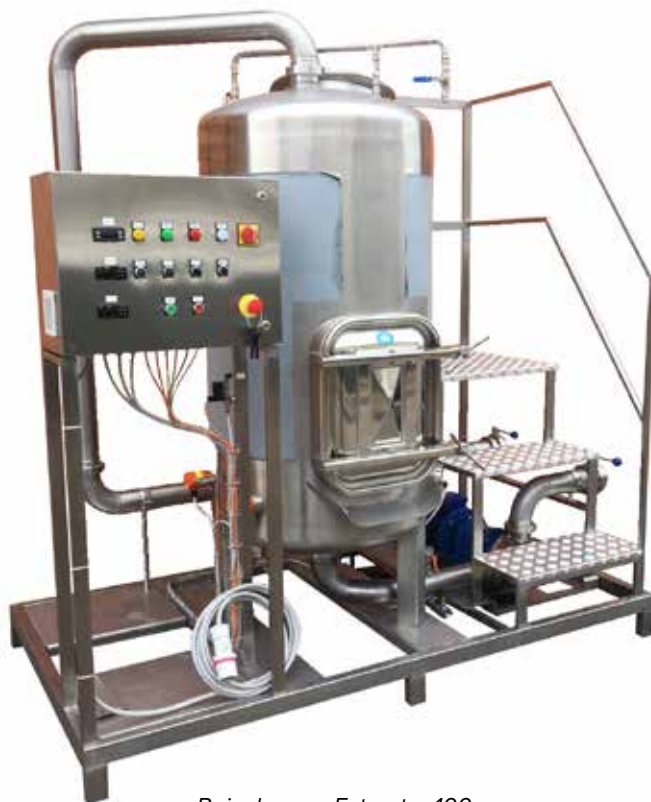
Boiselevage Extractor 100

The strong point of this machine relies in the homogeneous extraction through a high, well-distributed flow, which distill the wood essences without stressing the wine, thus avoiding the uncontrolled increase in astringency.