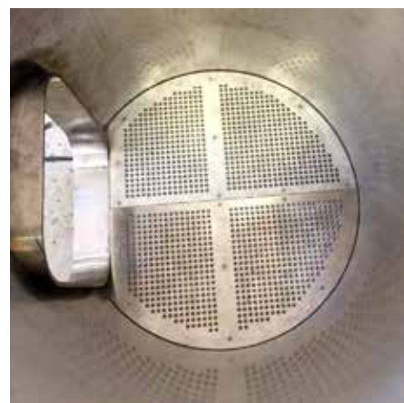
Filtering diffusion net