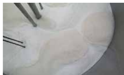
Photo 2 - After 10-15 minutes, the yeasts begin to consume sugars and produce a very thick foam with fine bubbles.