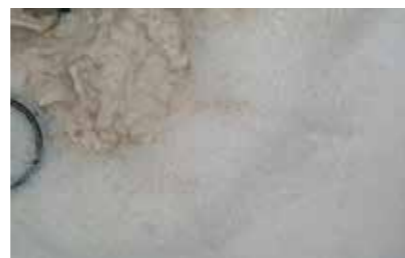
Photo 1 - In the first 5 minutes, the multiplying yeasts englobe water and produce a white foam with large bubbles.

These operations which, if carried out manually would require considerable labour and attention, are carried out automatically and in perfect sequence by Reactivateur 60 .