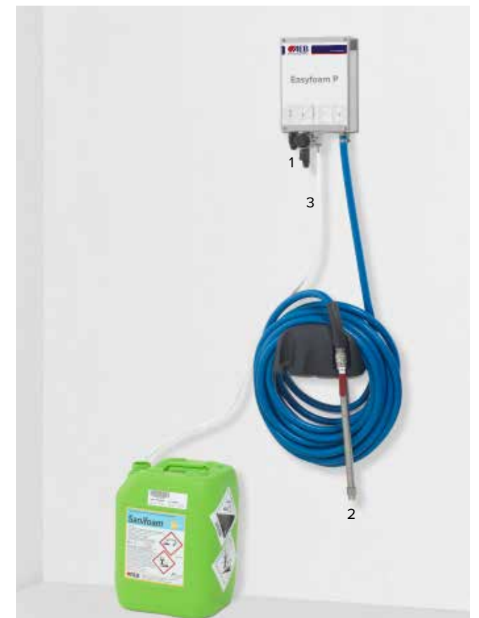
Double one-way valve, on the air and water inlet (1) Stainless steel wand (2) Suction system, for foam detergent and additive (3)