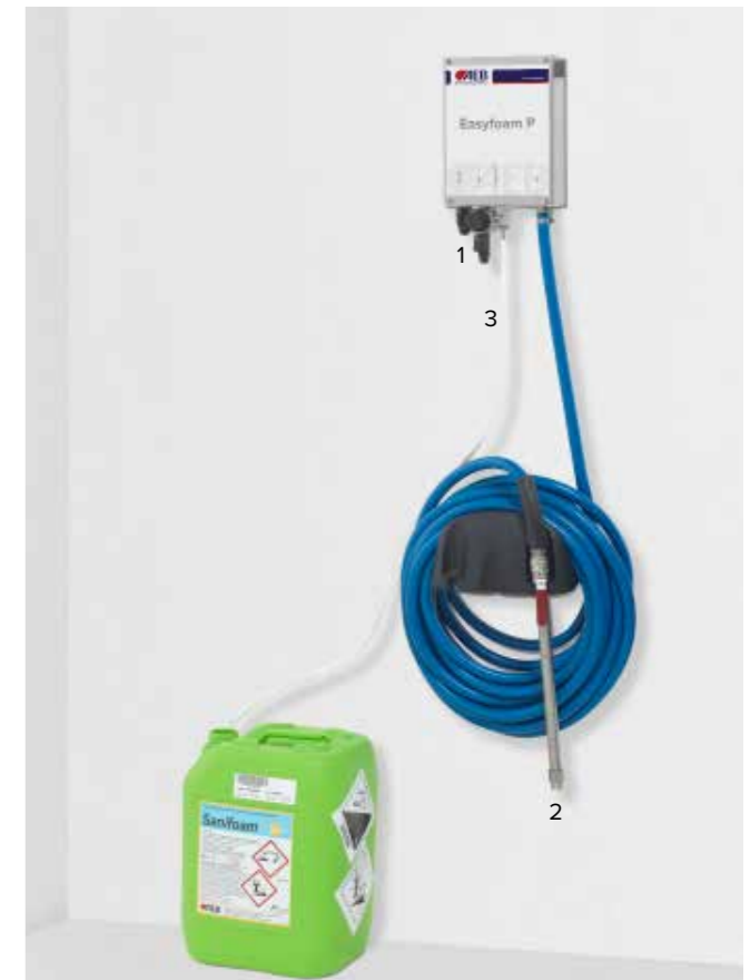
Double one-way valve, on the air and water inlet (1) Stainless steel wand (2) Suction system, for foam detergent and additive (3)