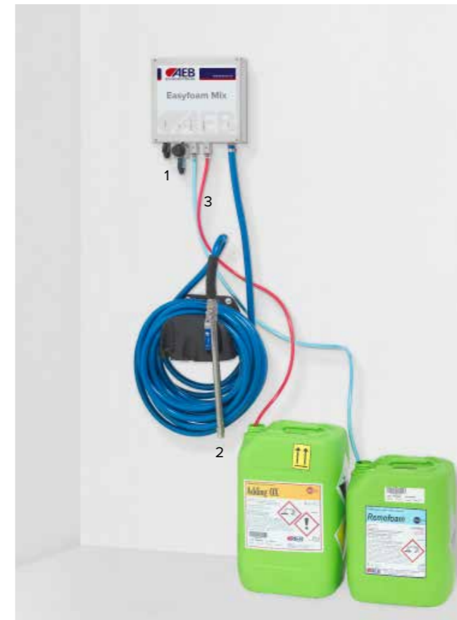
Double one-way valve, on the air and water inlet (1) Stainless steel wand (2) Double suction system, for foam detergent and additive (3)