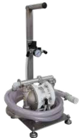
Autoclave dispenser with pump up to 50 L/min