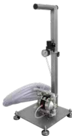
Autoclave dispenser with pump up to 18 L/min