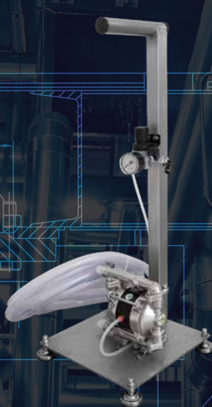
DOSER FOR AUTOCLAVES WITH PUMP UP TO 18L/MIN

EQUIPMENT FOR THE TRANSFER AND INJECTION OF SOLUTION PRODUCTS