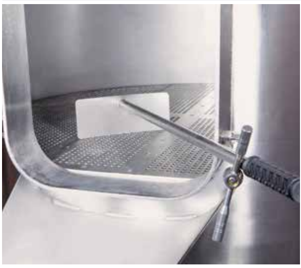
GRID AND CHIPS EXTRACTION PADDLE

The grid guarantees a perfect and homogeneous wetting thanks to the size of the holes that also hold the Boisélevage.