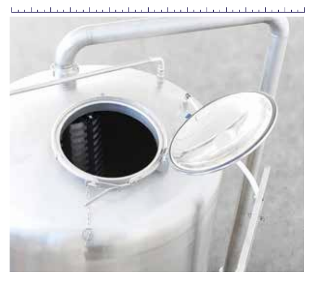
DOOR FOR BOISÉLEVAGE INTRODUCTION

The grid guarantees a perfect and homogeneous wetting thanks to the size of the holes that also hold the Boisélevage.