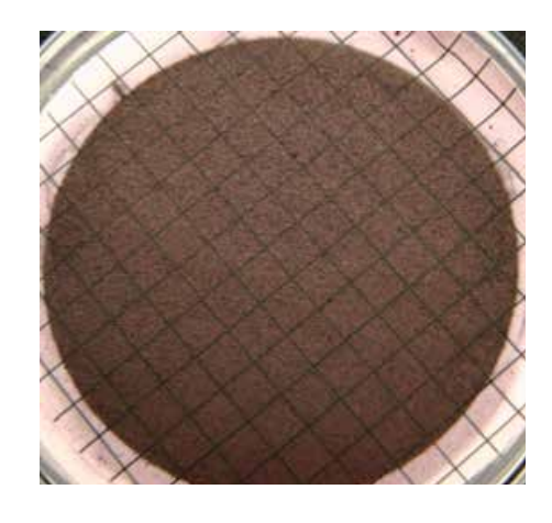
Sample with 5 g/hL of Chitocel